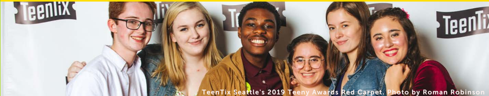
TeenTix Seattle's 2019 Teeny Awards Red Carpet.

Social media and our weekly e-newsletter will be our primary tool for activating usage. It lets our members know what is going on at each of our participating venues, and features teen-friendly programming descriptions and a weekly pick, along with trivia and other fun stuff.