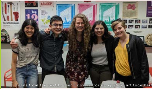
Teens from the Seattle TeenTix Press Corps exploring art together!