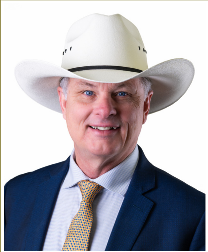
HONOURABLE MYLES McDOUGALL MLA FOR CALGARY-FISH CREEK