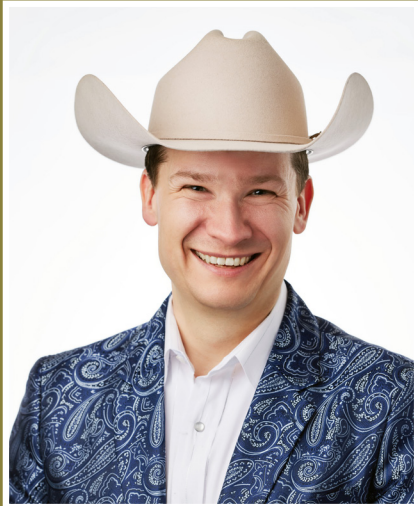
JEROMY FARKAS MAYOR, CITY OF CALGARY