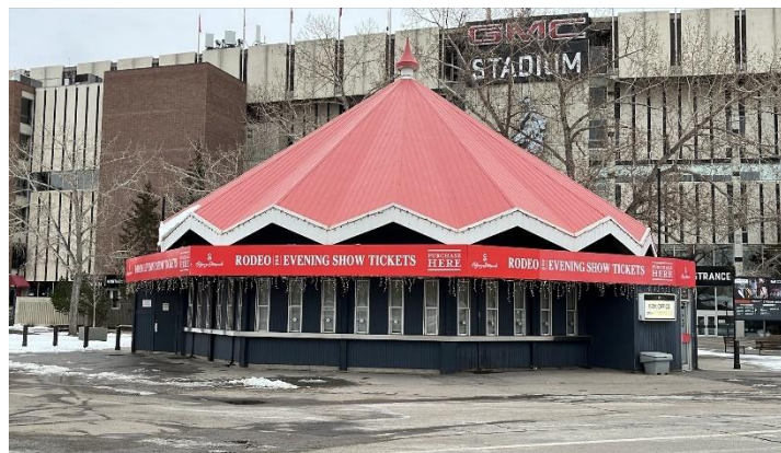
Ticket Office Building

For further Calgary Transit service and fares information, please go to www.calgarytransit.com .