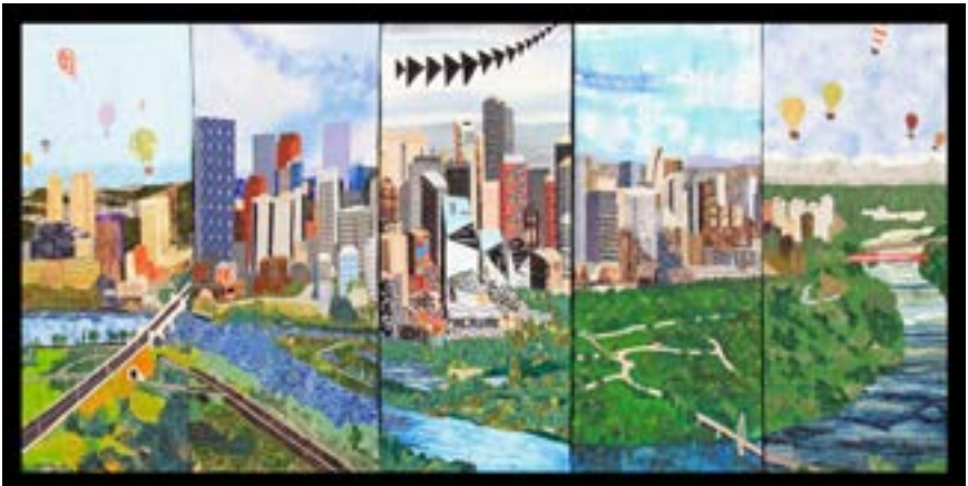
Quilted Mouse Guild

Here in the Calgary region, many guilds take part in the Creative Arts and Crafts Competition each year. Our Committee is happy to host a number of these guilds alongside our Competition displays. Please stop by and visit with guild members at the gazebo, where they will happily share their enthusiasm, skills, and expertise. You might just discover a new creative passion!