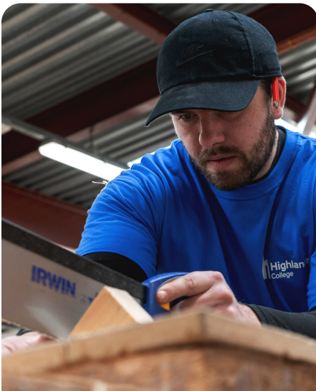
h Highlands Apprenticeships