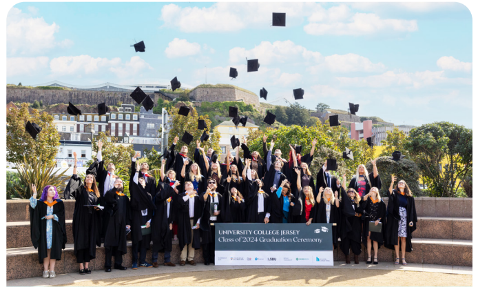
h University College Jersey