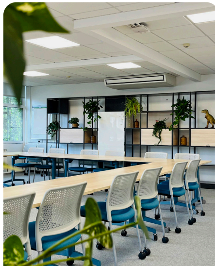
h Highlands Professional