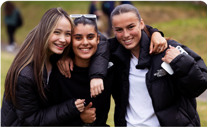
h 6th Form College Jersey

At Highlands College, we are committed to providing clear pathways for education and career progression. Our five major sub-brands help young people, parents, employers and islanders navigate the wealth of learning opportunities available, ensuring students are our priority.