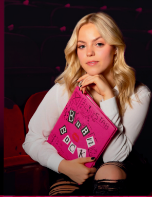
Andrew Barth Feldman & Reneé Rapp