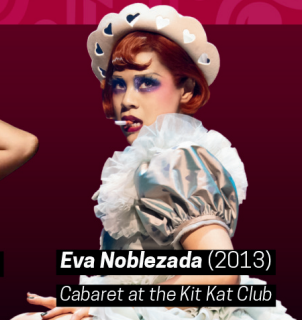
Eva Noblezada (2013)