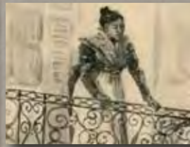
The Spanish Quarter.....9