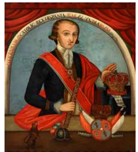
Portrait of Ferdinand VII, King of Spain, Viceroyalty of Peru, Cuzco School, ca. 1810; New Orleans Museum of Art (74.275)