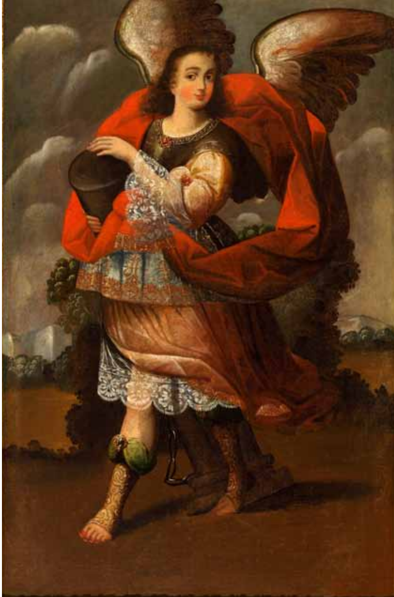
Archangel with a Column, Viceroyalty of Peru, Real Audiencia of Charcas (Bolivia), Circle of the Master of Calamarca, late 17th–early 18th century; New Orleans Museum of Art (74.277)

Academic interest in Spanish viceregal art has surged in recent years. Previous generations of scholars, steeped in Eurocentrism, tended to view colonial works as secondary copies of European ones. Anti-colonialists, meanwhile, associated them with the opulence of the Catholic Church and the oppression of the Spanish Crown. In 1992 the commemoration of the quincentennial of the arrival of Christopher Columbus in the Americas prompted the revision of these approaches, and now art historians and the general public are regarding the works from the viceregal period as the