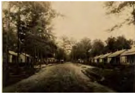
Union Sulphur Company houses in early Sulphur, Louisiana, ca. 1915 (2010.0270.2)