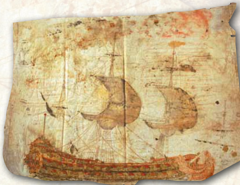
Lateral view of the French ship Belle, which René-Robert Cavelier, sieur de La Salle, sailed from France on an expedition to establish a colony in Louisiana in 1684; Seville, Archivo General de Indias, MP-Ingenios y Muestras, 9

Spain and the United States • España y los Estados Unidos