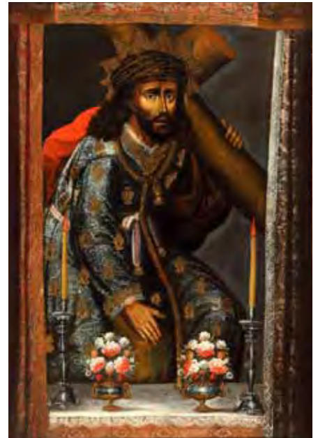
Christ Bearing the Cross/Lord of the Fall, Viceroyalty of Peru, Cuzco School, late 17th century; New Orleans Museum of Art (74.258)

Background image: Plan del local de las tierras que rodean la ciudad de Nueva Orleans by Carlos Laveau Trudeau, 1803; The Historic New Orleans Collection (1940.2)