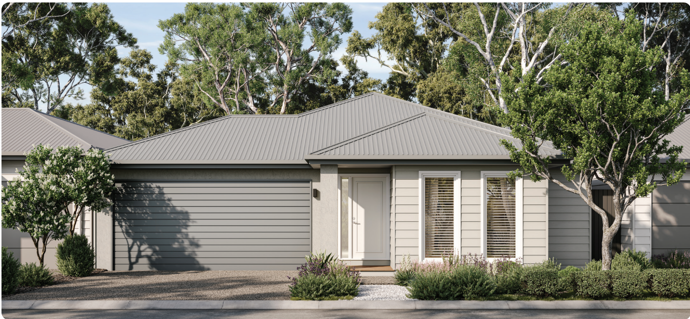
Façade: Birch | External colour: Jute

Boasting three generous bedrooms, two bathrooms, a modern kitchen, open plan living and stunning alfresco, there's a lot to love when you come home to the Hudson.