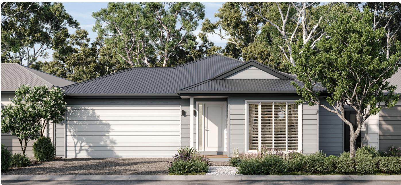
Façade: Wattle | External colour: Stormy

To ensure that every home complements its surroundings, the exterior colours and façade of your home have been carefully pre-selected as part of the overall masterplan.